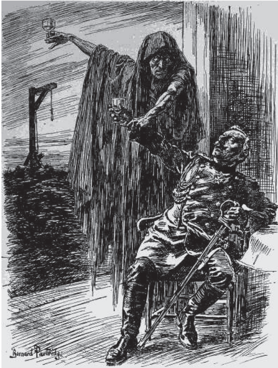
A cartoon published in Britain in 1915. The Kaiser is saying 'To the Day...', but the figure of Death adds the words '...of reckoning!'