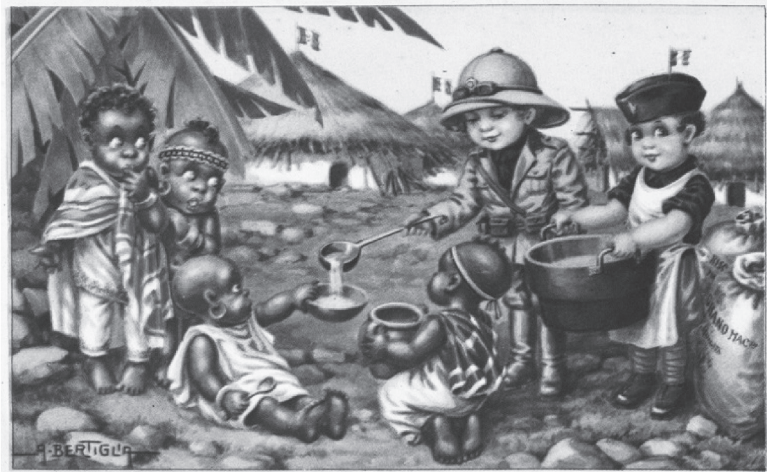
A postcard published in Italy in 1936 showing Italian and Abyssinian children in Abyssinia.